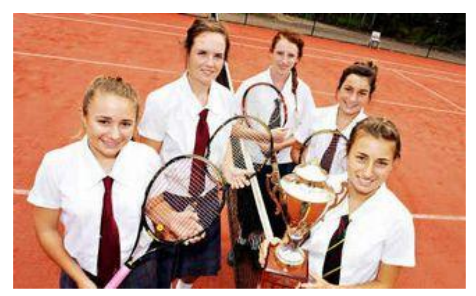
Winners Australian School Teams Challenge - Girls Sunshine Coast Grammar (QLD)