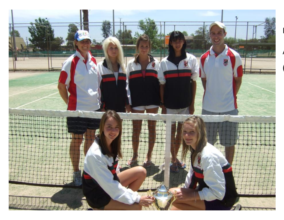
Runners Up Applecross Senior High School (WA)