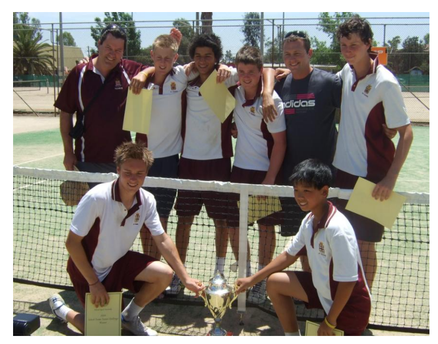
Winners Australian School Teams Challenge - Boys