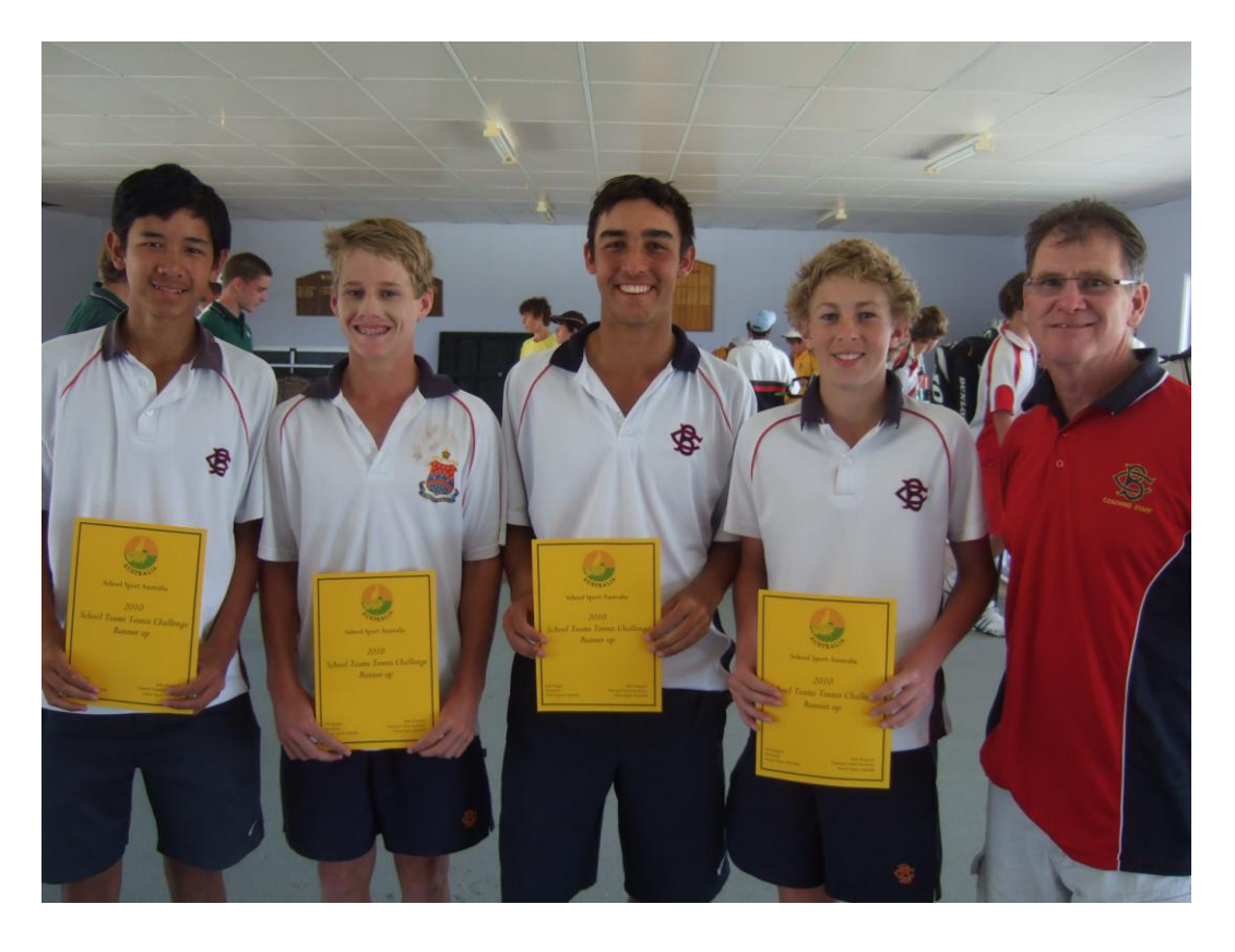
Runners up 2010- Barker College, Hornsby, Sydney, NSW.