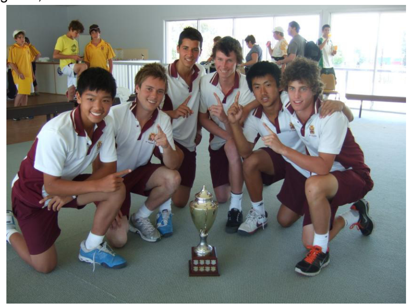
Number 1, two years in a row! Congratulations to Prince Alfred College, Adelaide.