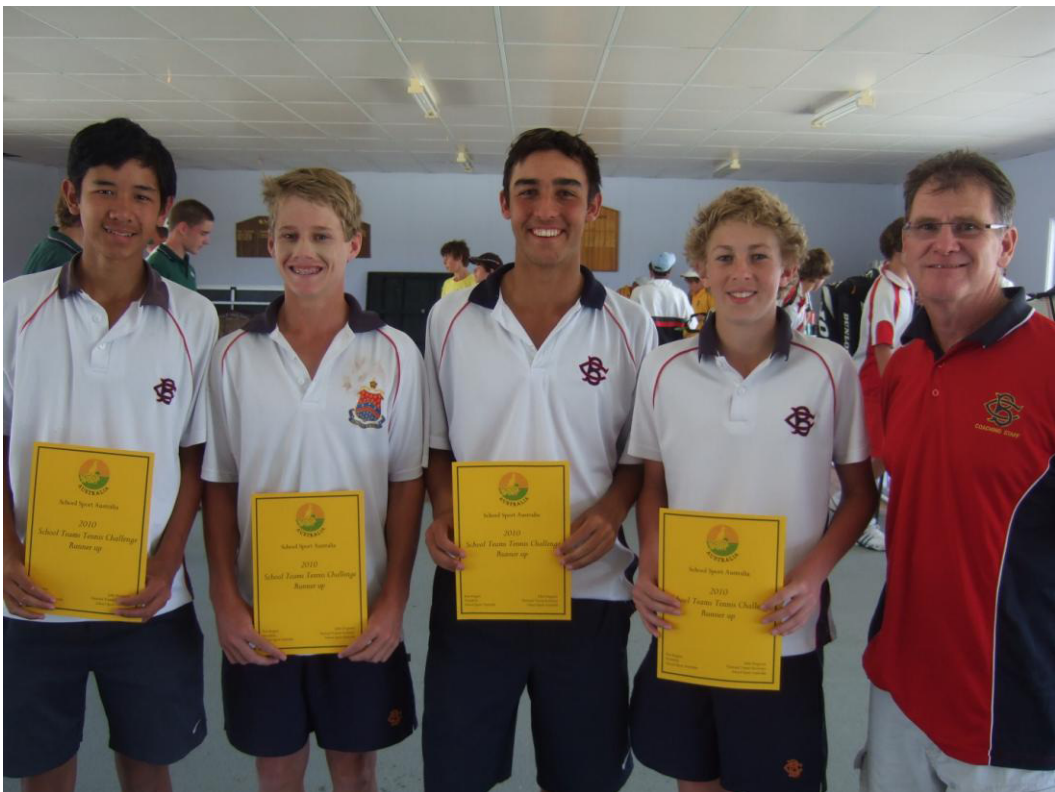
Runners up 2010- Barker College, Hornsby, Sydney, NSW.