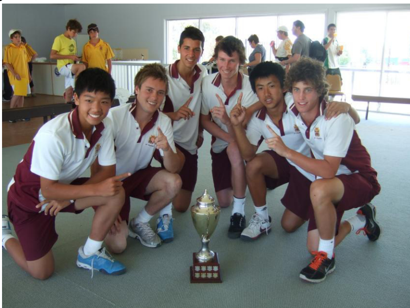
Number 1, two years in a row! Congratulations to Prince Alfred College, Adelaide.